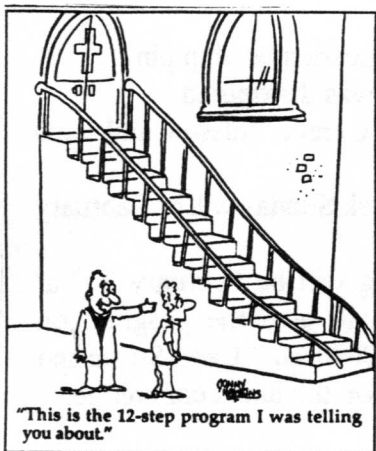
from The Joyful Noiseletter