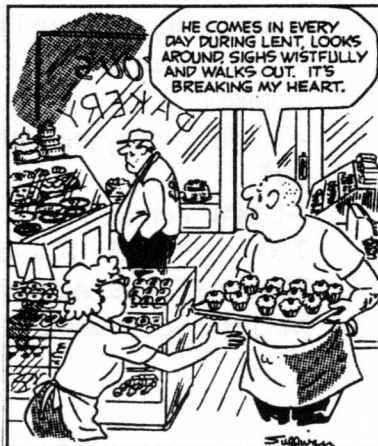
from The Joyful Noiseletter