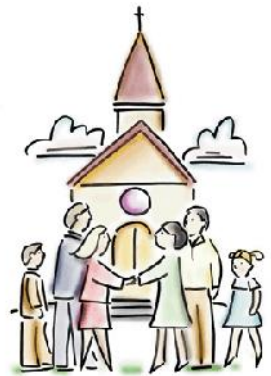
Invite a Neighbor to Church

When the world is at its worst, it needs the church at its best – a strong church. We strengthen the church by giving. We give because we care deeply for Christ and his kingdom, and for the hurting humanity of our time. We give our time, our money, our energy and our talent. We give to promote and develop programs, resources, leadership, family life, evangelism and more. We give guidance, encouragement and help to those in need. We give to establish new churches, new ministries and new missions. We give so the kingdom can grow – grow strong.