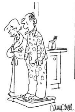
"Man does not live by bread alone. Man has been adding a great deal of butter."

The next meeting of the Administrative Council will be February 11 th at 7:30 pm. All church members are welcome to attend.