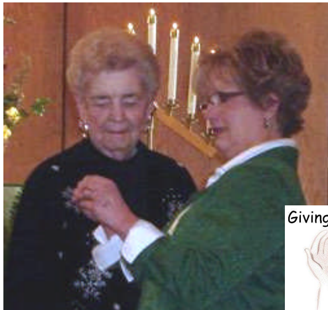
Giving Our Hearts