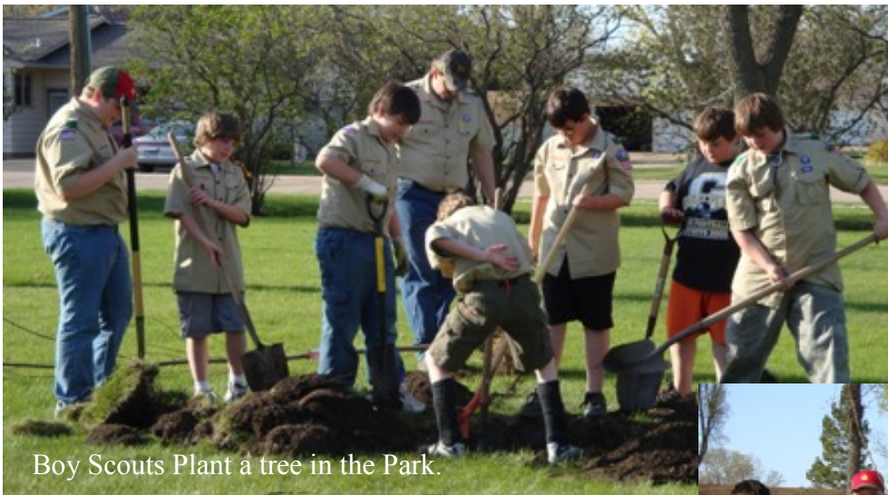
Boy Scouts Plant a tree in the Park.