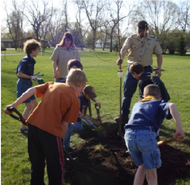
Cub Scouts Plant a tree in the park.