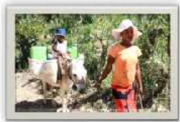
Paths, Proverbs, and Lessons from Haiti by Bruce L. Blumer

All items must be new. Pattern for the bags may be found online at www.umcor.org . Place all loose items on top of paper. Turn items sideways and slide into the cloth bag. Fold over the top of the bag so loose items don't fall out.