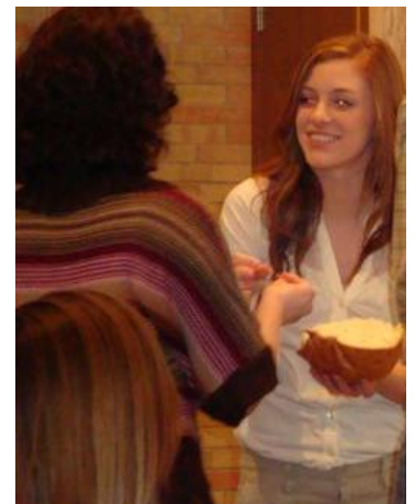
Photos of Groton youth ski trip and Youth Sunday throughout this newsletter