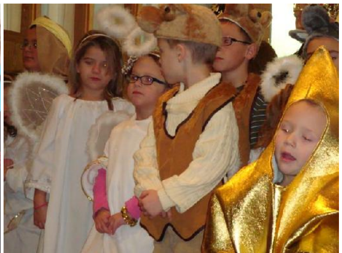
Groton Sunday School Christmas Pageant