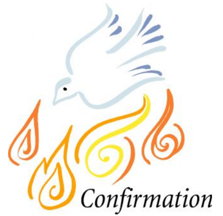
Groton Confirmation Sunday