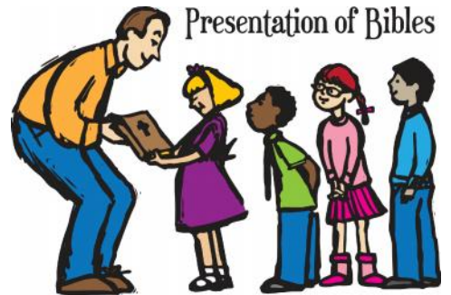
Presentation of Bibles

If you would like to donate some bars for the meetings, please contact Kami Lipp at 397-2613.