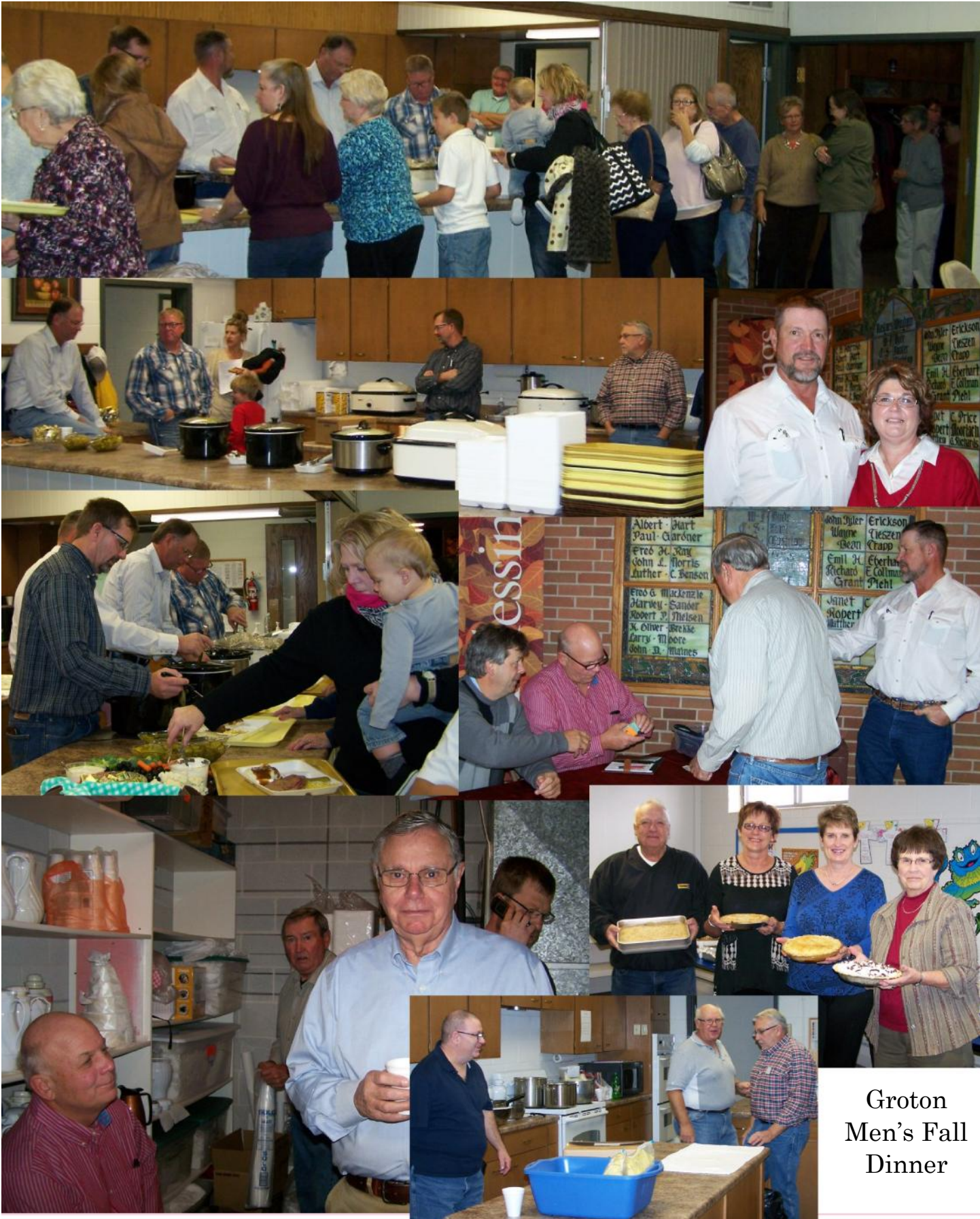
Groton Men's Fall Dinner