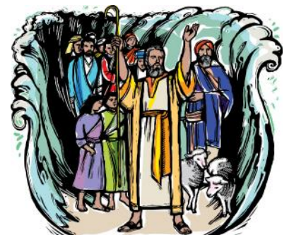
Moses Parts the Red Sea

"Well, no," he admitted. "But if I told it the way the teacher did, you'd never believe it!"