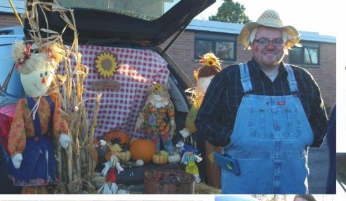
Trunk or Treat Photos from Halloween