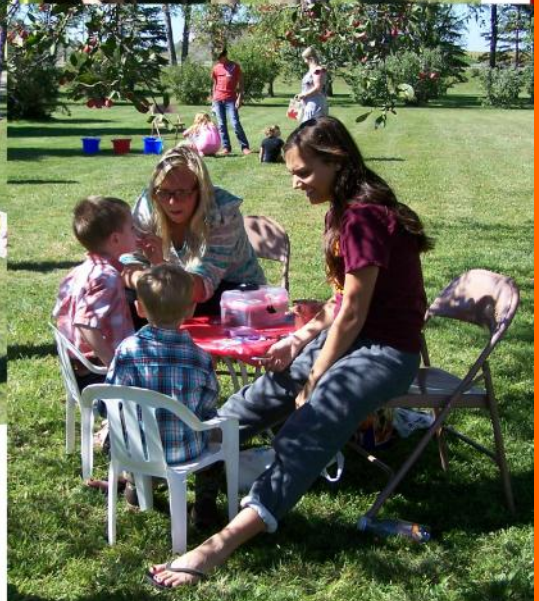
Groton Back to Sunday School Bash on Sept 13