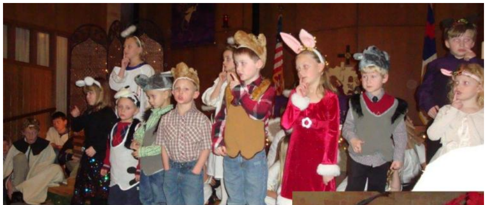
Sunday School starts in church. After the Children's Sermon, they are dismissed to the classrooms.