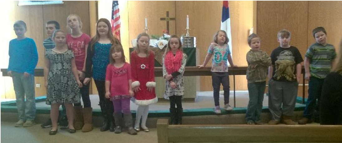
Children Sang in Church