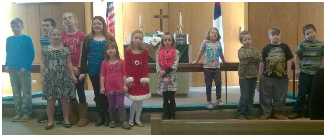
Groton Sunday School Sang in Church In February