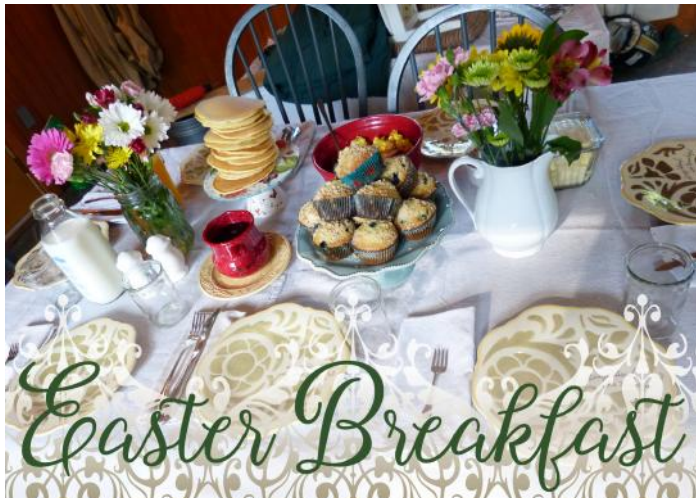
following Groton UMC Sunrise Service